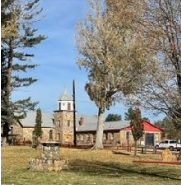
The Stewart Indian School In Carson City