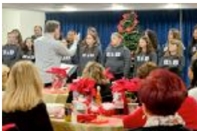
Holiday Luncheon Choir from Billingham M.S.