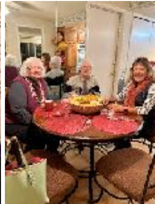
Lambda and Xi's dinner with guest speaker from Project 50