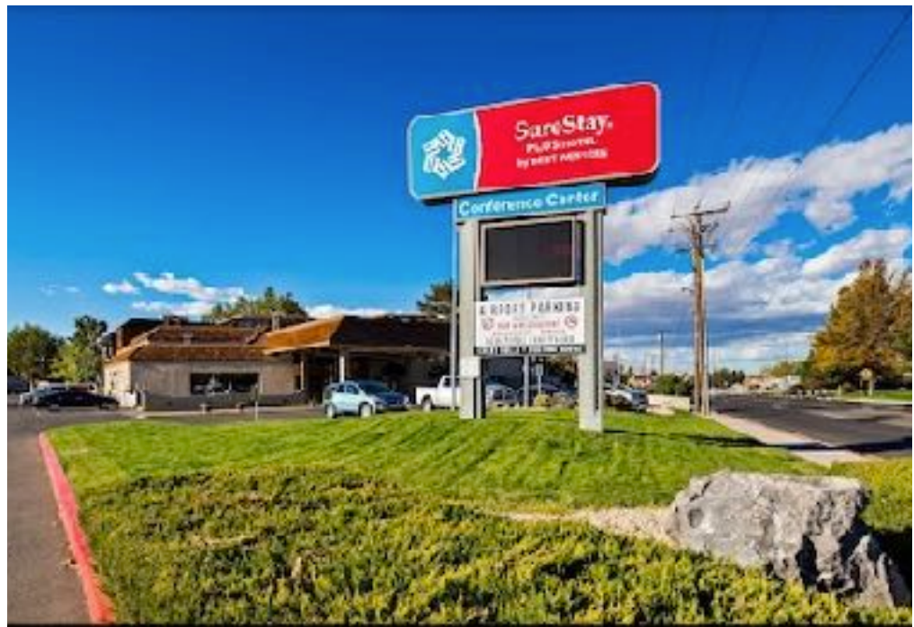
Convention: SureStay Hotel by Best Western at 1981 Terminal Way

2025 Chapter Convention Plan- ning Responsibili-